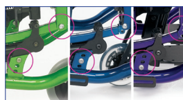
Tilt assist feature

All frame color in photography are used to show chair features. Limited color selection available through Solara 3G Wheelchair SmartSelect programs.