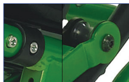
Color coded hardware