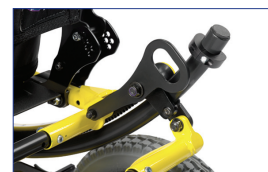
Transport brackets (TRBKTS)