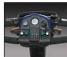
Delta tiller for optimal handling

The Pursuit ® XL is an exciting blend of power and precision that features full suspension, low-profile tires and a hydraulic sealed brake system. Standard luxury touches like a wrap-around delta tiller and LED lighting make it the ultimate outdoor scooter.