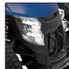
LED lighting package