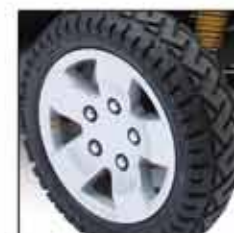
Large 13" pneumatic tires